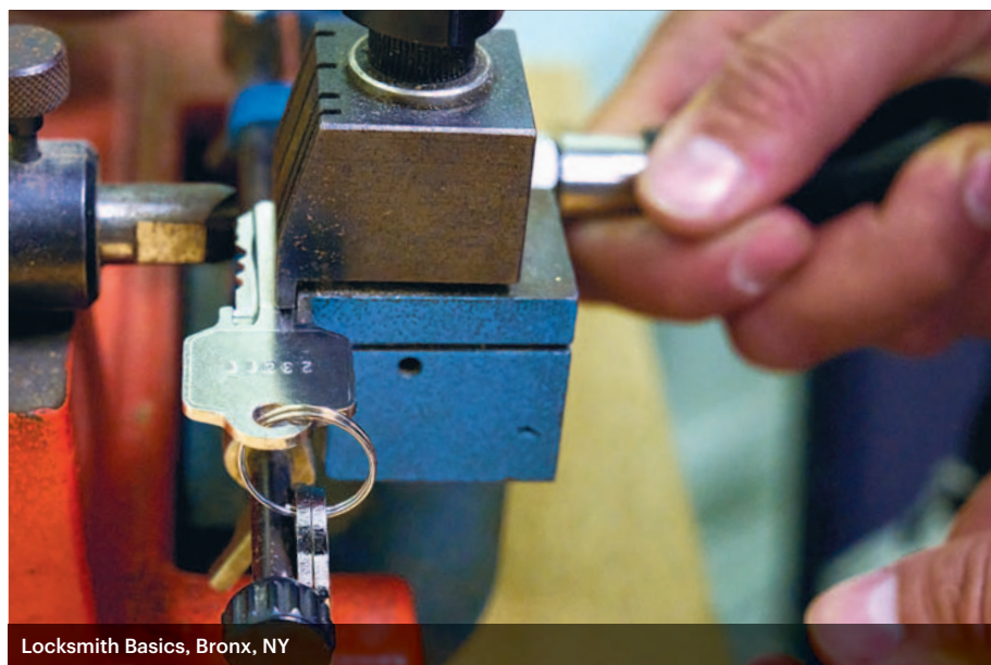
Locksmith Basics, Bronx, NY