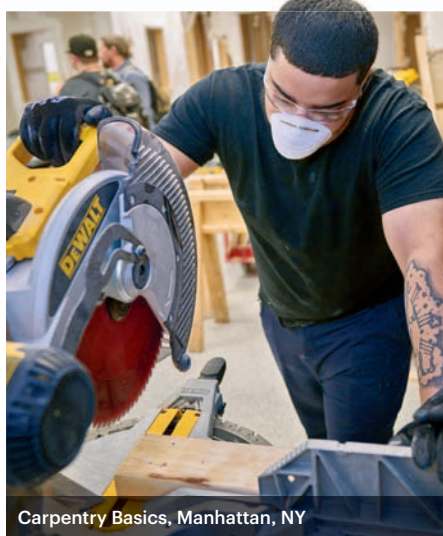
Carpentry Basics, Manhattan, NY