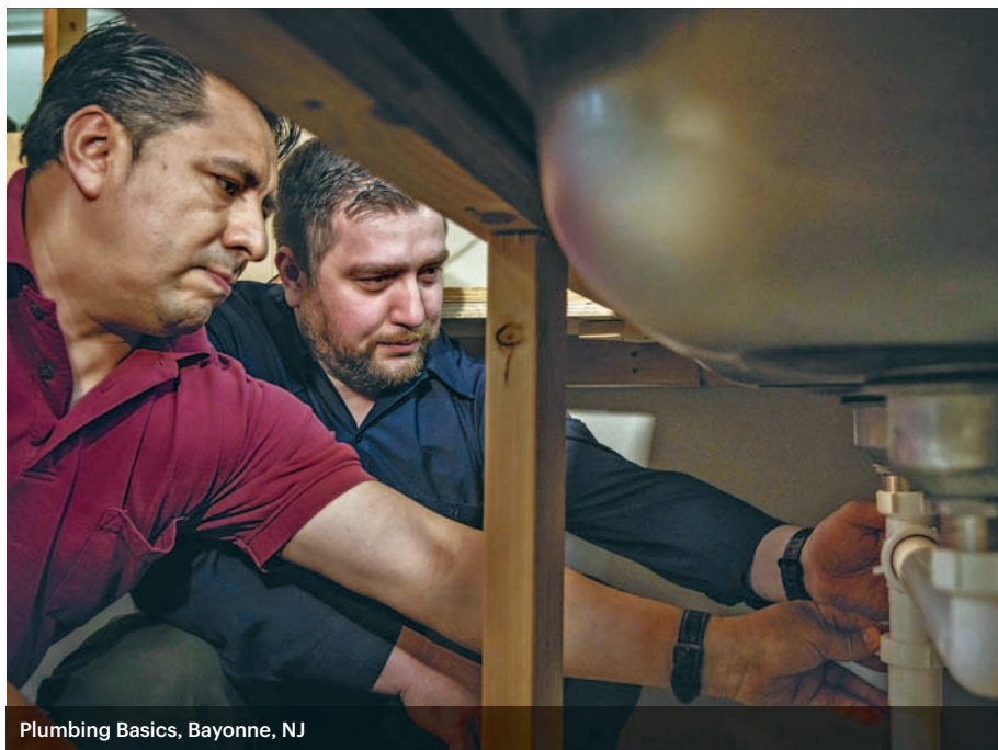
Plumbing Basics, Bayonne, NJ