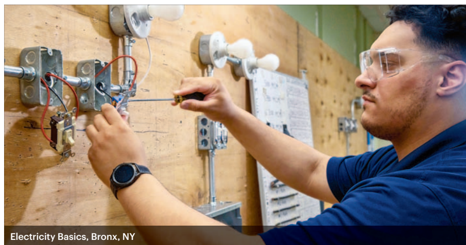
Electricity Basics, Bronx, NY