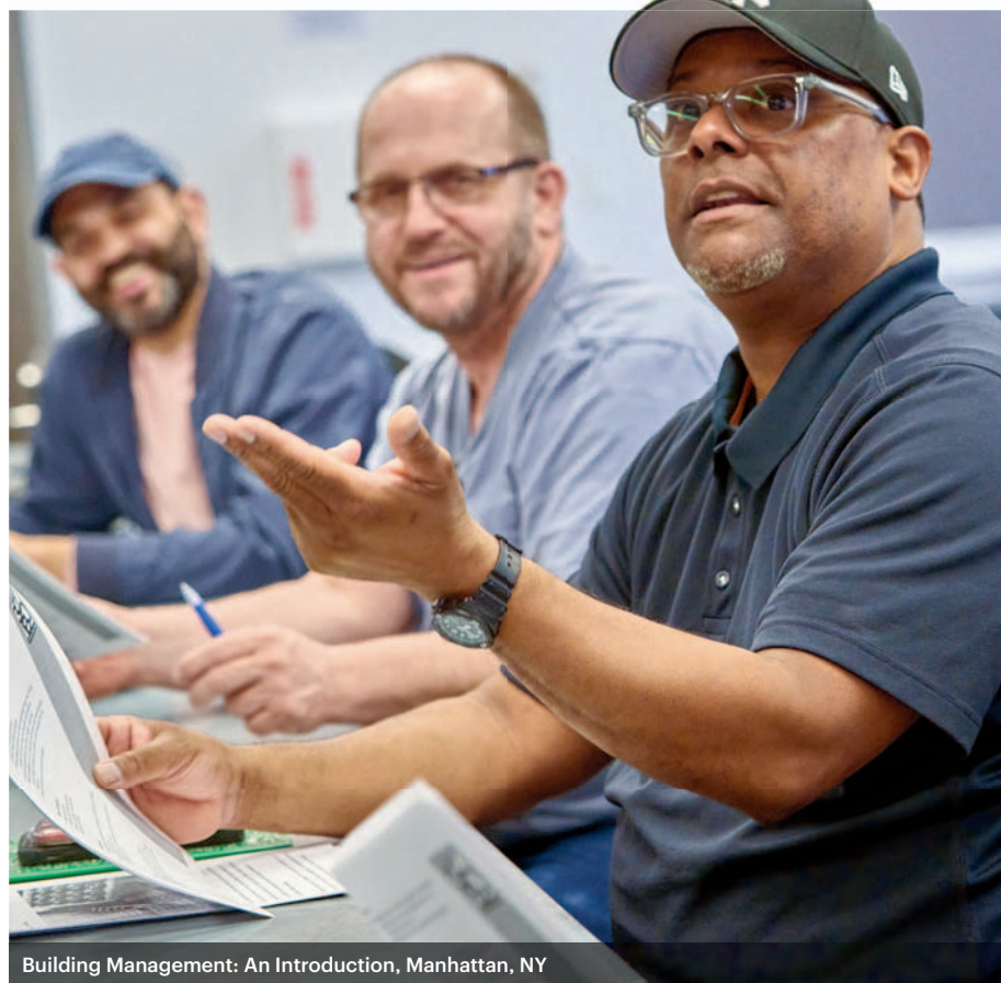
Building Management: An Introduction, Manhattan, NY