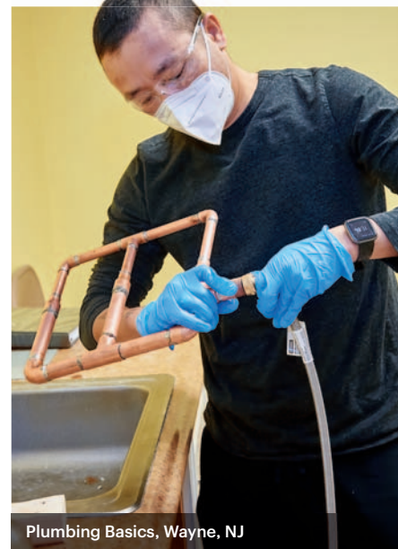
Plumbing Basics, Wayne, NJ