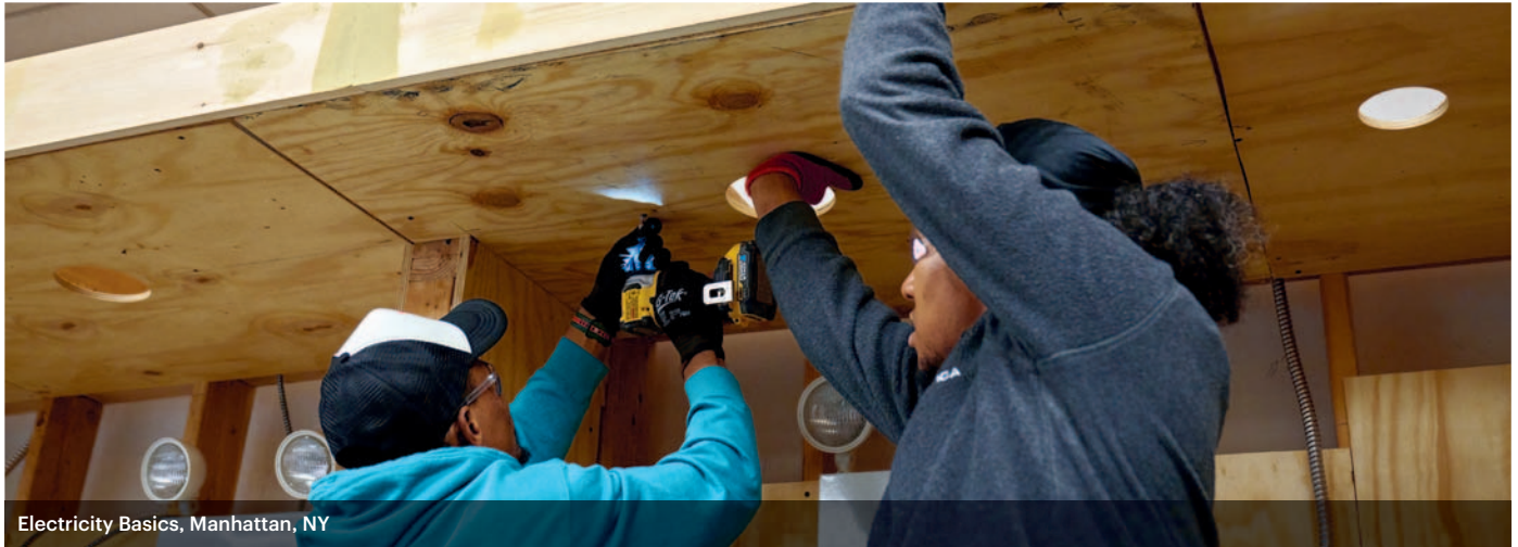
Electricity Basics, Manhattan, NY