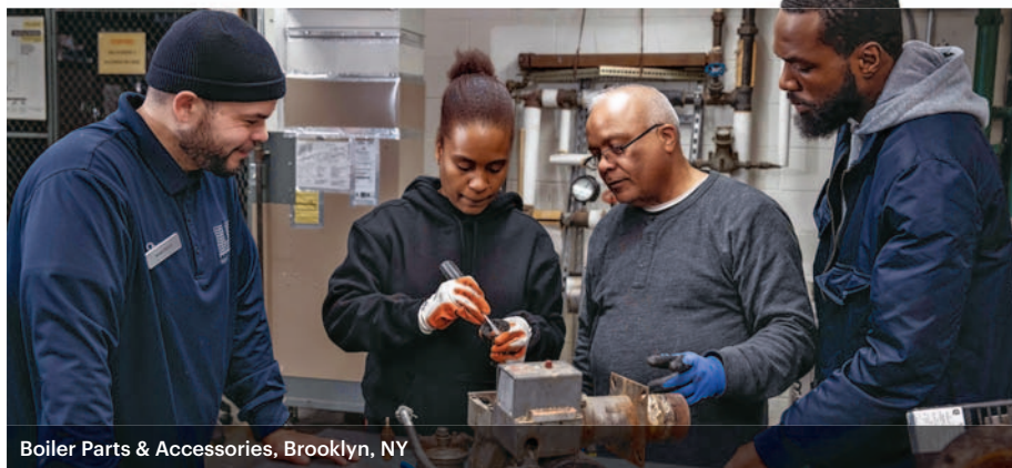
Boiler Parts & Accessories, Brooklyn, NY