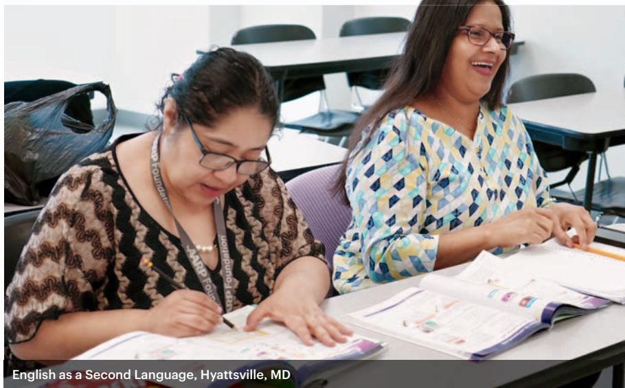
English as a Second Language, Hyattsville, MD