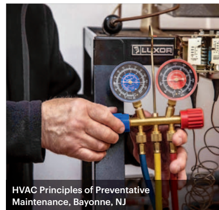
HVAC Principles of Preventative Maintenance, Bayonne, NJ