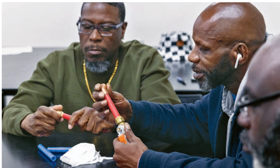
Plumbing Basics, Philadelphia, PA