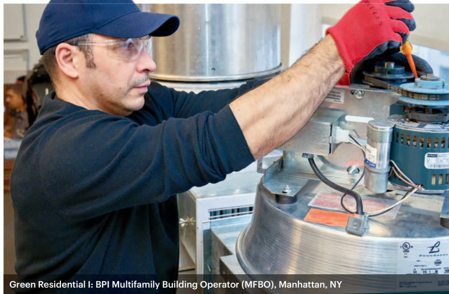
Green Residential I: BPI Multifamily Building Operator (MFBO), Manhattan, NY