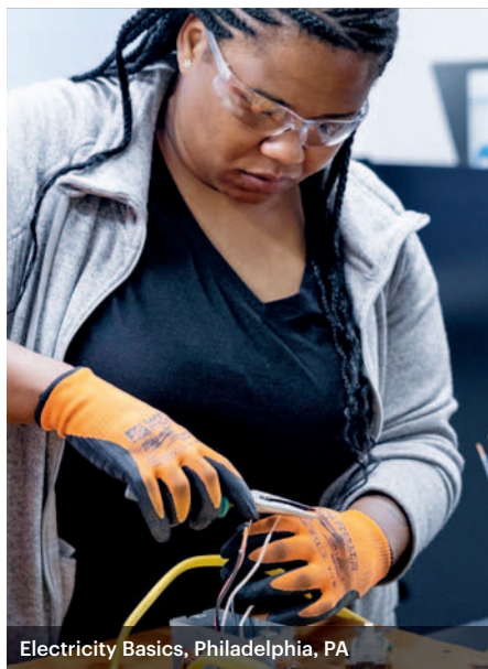
Electricity Basics, Philadelphia, PA