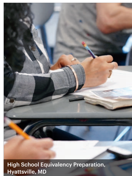
High School Equivalency Preparation, Hyattsville, MD