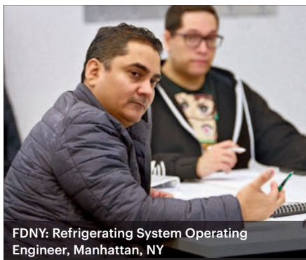
FDNY: Refrigerating System Operating Engineer, Manhattan, NY