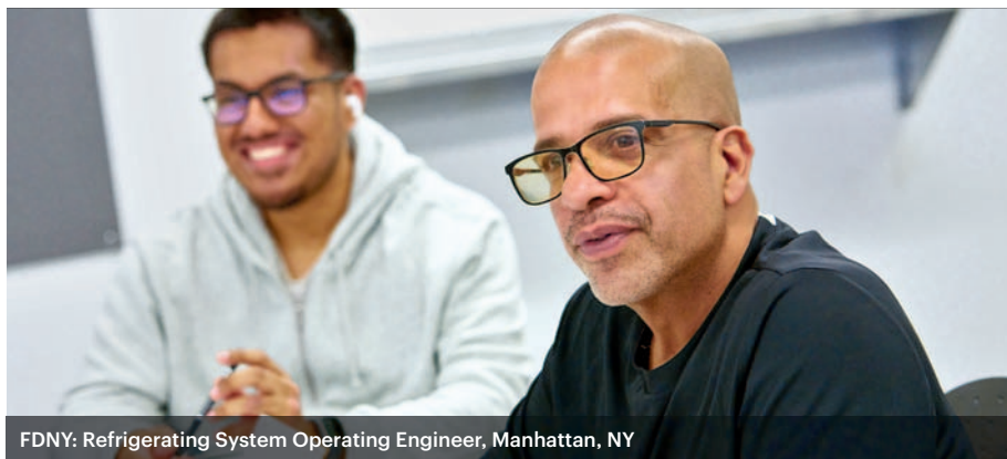
FDNY: Refrigerating System Operating Engineer, Manhattan, NY