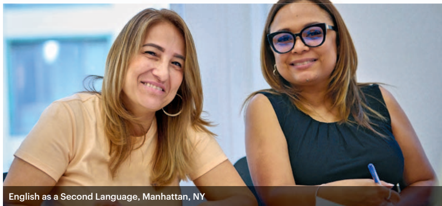
English as a Second Language, Manhattan, NY