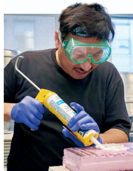
Green Residential I: BPI Multifamily Building Operator (MFBO), Manhattan, NY